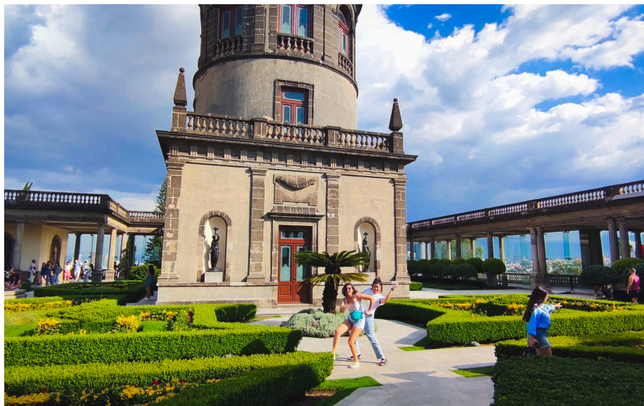
Daaaamn! We are goofy.